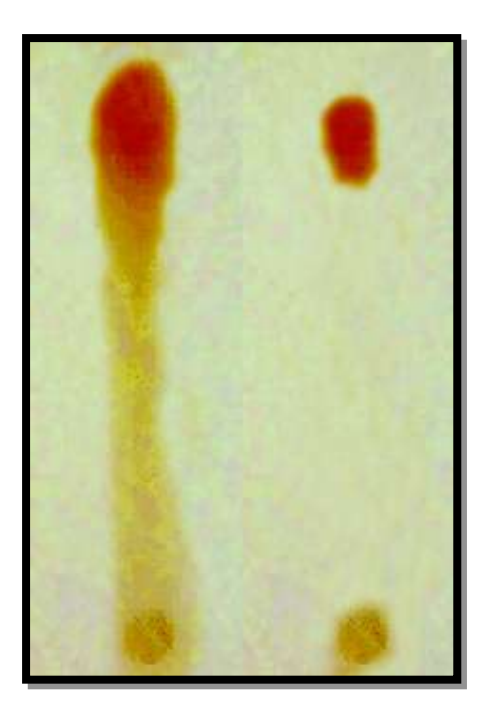
Fig. (2): TLC profiles of: crude extract (left) and purified cantharidin (right).